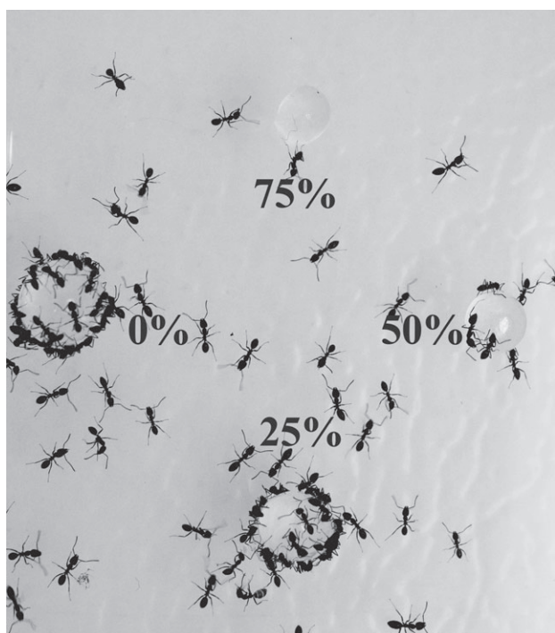
Figure 2. Choice feeding arena with hydrogel beads that lost 0, 25, 50, and 75% of water at 5 min post introduction into test arenas.

at the 0.05 level of significance were used to compare the data at each time point. 59