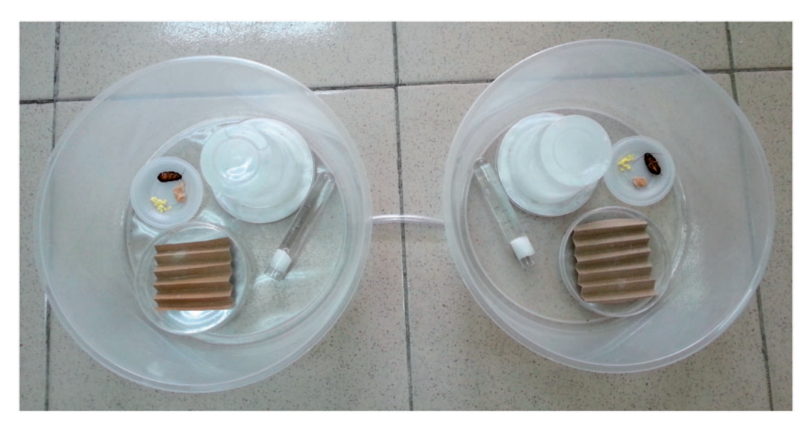
Fig. 1. The experimental arenas.